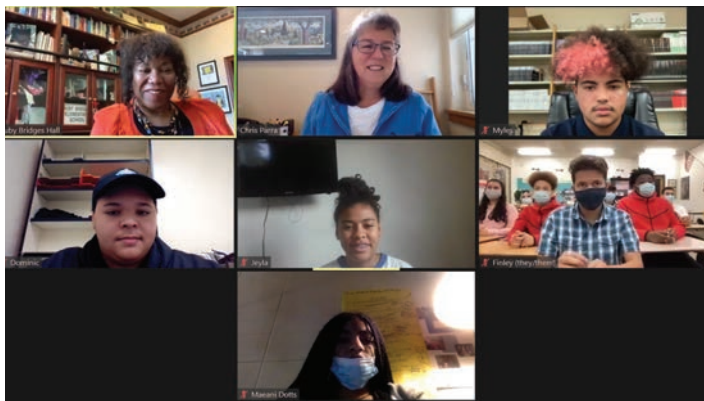
Civil Rights advocate Ruby Bridges (top left) helped us launch the fund at a virtual community event and spoke with Lane County students about her inspiring story

“ Each and every one of us needs to understand that we have that responsibility, and we need to find what speaks to us. There’s so much work that needs to be done. ”