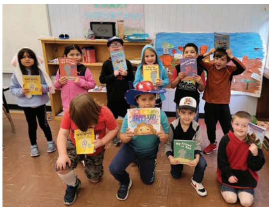
Students with the books they received during BookFest 2022.