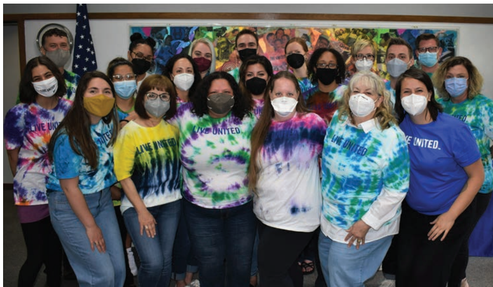
United Way staff, June 2022