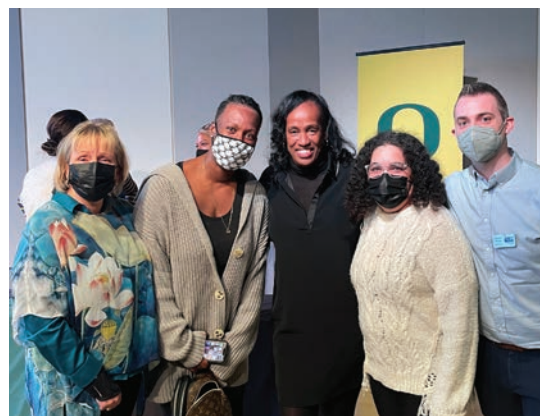
United Way staff members with Olympic athlete Jackie Joyner-Kersey